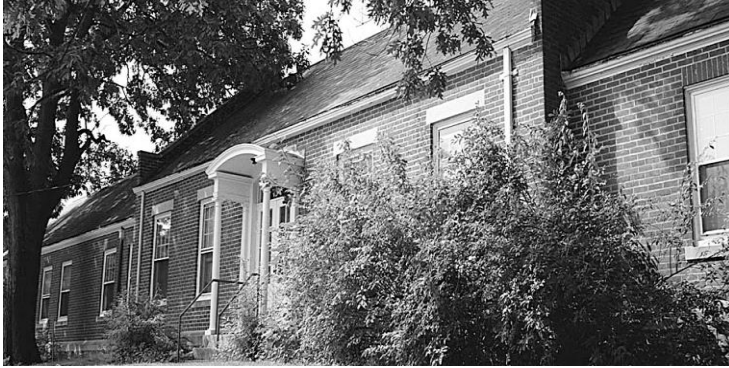
The Cottage, built in 1919. UConn's first infirmary and the School of Nursing's first home.