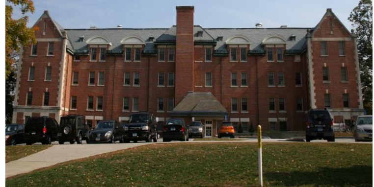
Storrs Hall, built in 1908. Used first as a dorm and now houses of the School of Nursing.